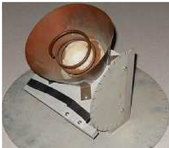
Collins Early GPS_Horn